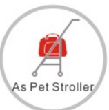
As Pet Stroller