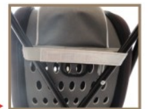
The look when velcro strips fixed with frame.