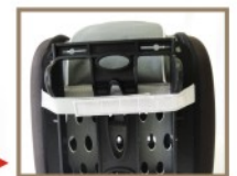
The look when velcro strips fix with pull rod.