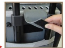
Fix the velcro strip with pull rod as picture shown.