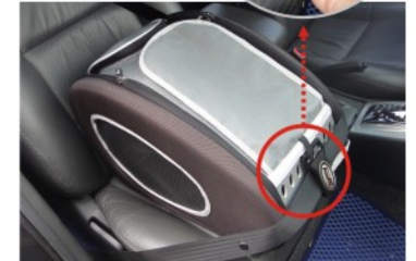
Fasten the velcro strap with seat belt as car seat.