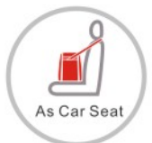
As Car Seat