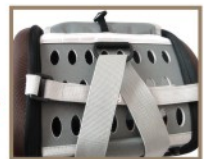
Put strap through top D-ring and fasten as backpack.