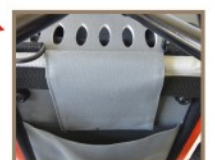
Attach rear velcro strip to stroller frame.